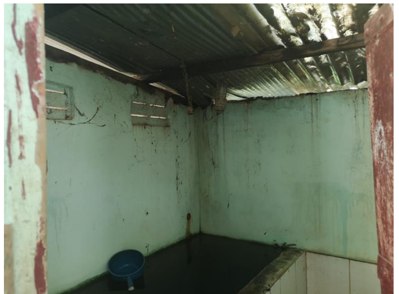
Toilet where work is required