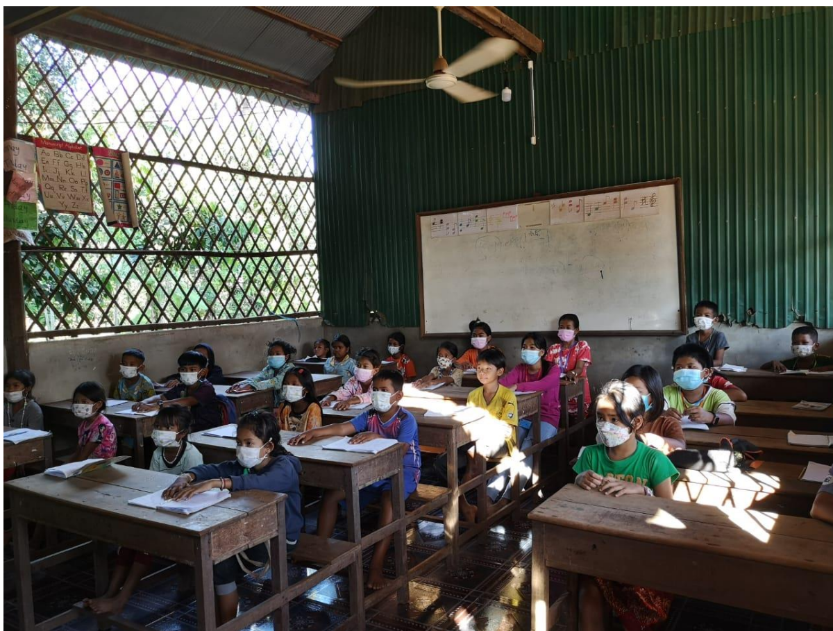
Students back at Oroluos School